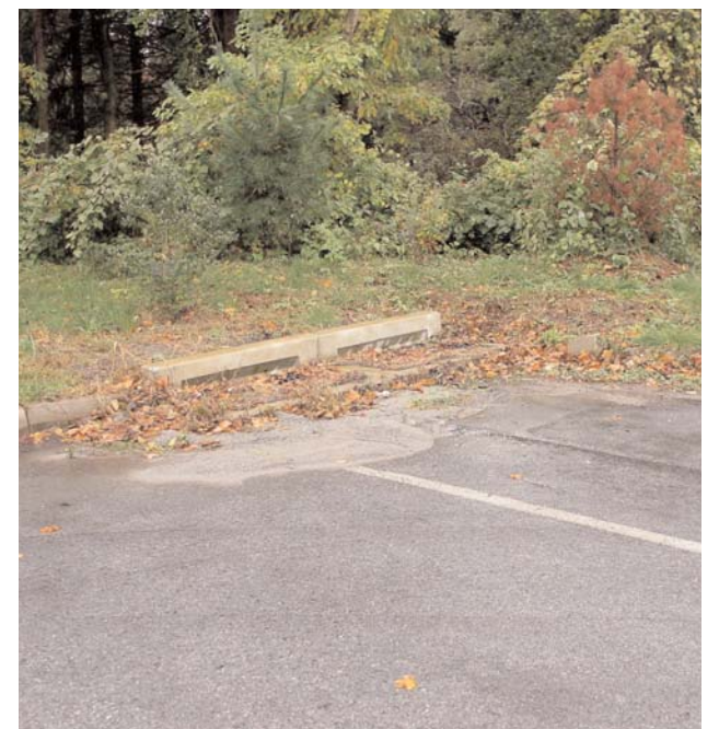
Periodic removal of collected debris and sediment trapped by storm catch basins is a simple but important maintenance practice.

Stormwater facilities include a wide assortment of constructed practices designed to manage, treat, control and/or infiltrate the stormwater runoff from a certain area of land. Typical facilities include swales, sumped storm inlets, infiltration basins, and detention basins. But the best stormwater management facility design cannot preclude the need for long-term maintenance and repair of these facilities in order to keep the facility functioning as originally designed. Lack of proper operation and maintenance is often cited as the number one reason for failure of stormwater facilities.