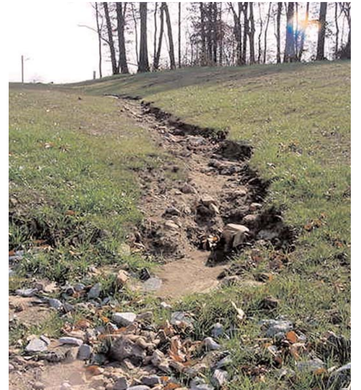
Remedial maintenance is necessary when some part of the facility deteriorates due to aging or damage, such as the excessive erosion in this swale.

Remedial maintenance refers to the non-routine or corrective maintenance, rehabilitation and/or reconstruction of the stormwater facility that is not otherwise addressed under routine maintenance. Remedial maintenance is typically done when some part of the facility deteriorates due to aging or damage. Remedial maintenance may involve repairing or replacing inlet or outlet structures, or repairing areas of excessive erosion and slope failure.