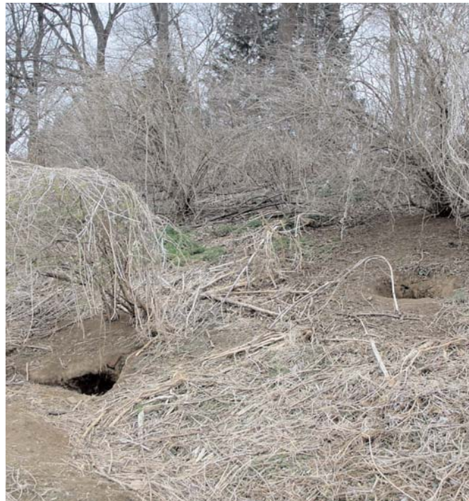
Constructed stormwater basin berms can be damaged by burrowing animals. This can lead to possible failure of the basin.